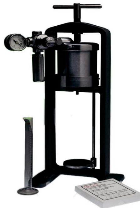
207224 Filter Press w/ CO 2 Pressure Assembly

Registered in England number 4514202: VAT number GB 900 7819 34